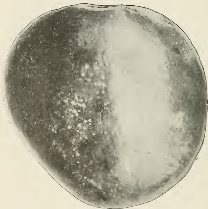
MANGA MAMEY, FROM THE QUINTA AVILES, CIENFUEGOS. A HANDSOME FRUIT OF GOOD QUALITY.